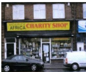
Liverpool Old Swan Shop

The two charity shops in Liverpool and Ainsdale have gradually returned to normal working, where those who seek extra safety from the virus, volunteer staff or shoppers, protect themselves by wearing masks. In Liverpool, the weekly takings have now returned to pre-Covid income, and the Ainsdale shop has returned to near normality. We continue to be grateful to our managers and volunteers who carry a busy workload to keep the shops running effectively.