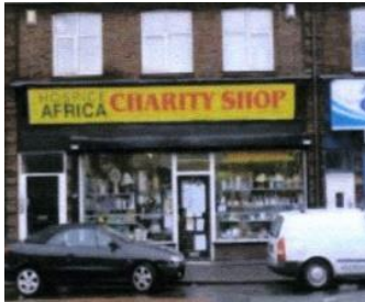
Old Swan Shop, Liverpool